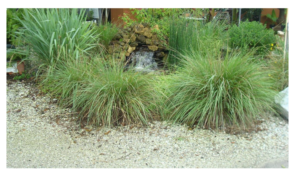
Fakahatchee Grass, Dwarf