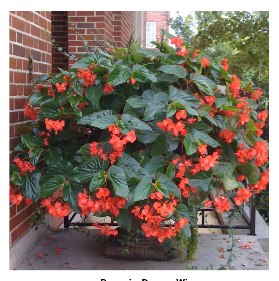
Begonia, Dragon Wing