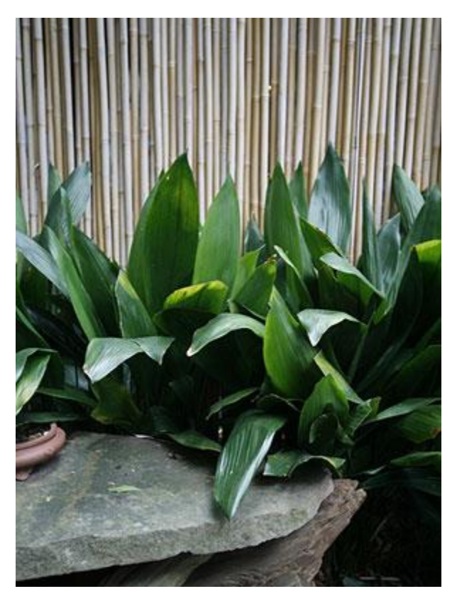
Cast Iron Plant