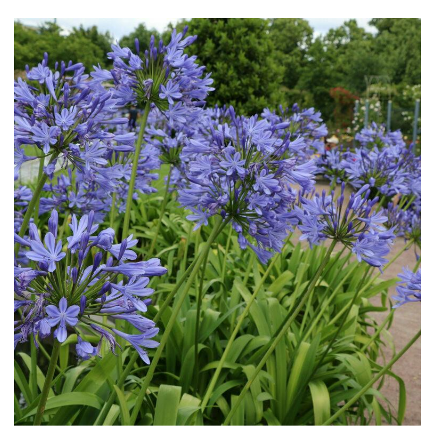
Lily of the Nile